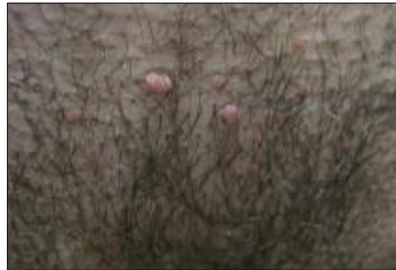
Figure 1. Papules in the pubic region.

Genital warts are due to the double-stranded HPV of which more than 90 strains have been identified. Approximately 90% of the strains are HPV-6 and HPV-11 which have minimal neoplastic potential. Another 15 strains have increased potential for genitourinary neoplastic